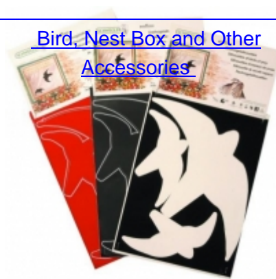
Bird, Nest Box and Other Accessories

New products coming soon... Contact us if you need help with this credit