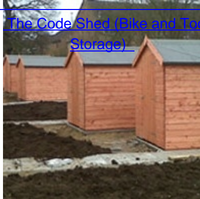
The Code Shed (Bike and Tool Storage)