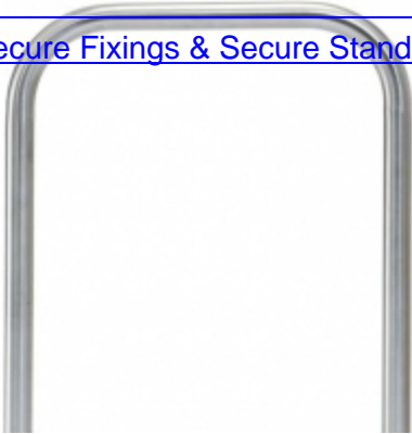
Bike Proprietary Storage and Hanging Systems