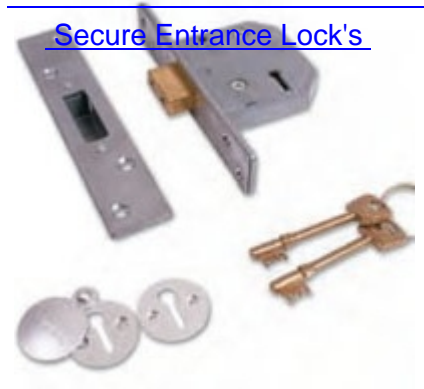
Secure Entrance Lock's